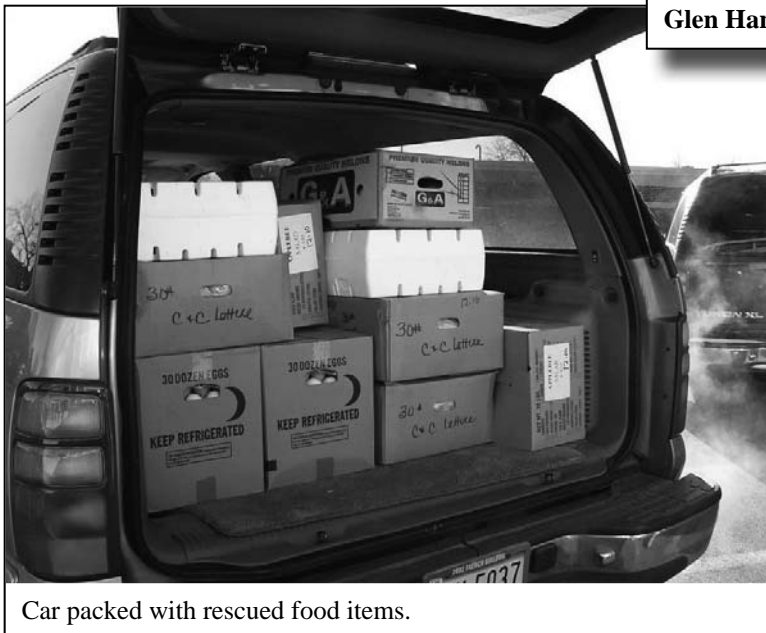
Car packed with rescued food items.